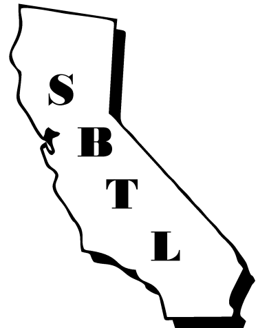
February 2015 Awards Optical Crystal